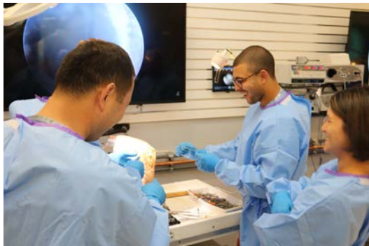
Hands-on resident education at the annual Arthroscopy Basics Course

We produce a diverse population of compassionate physician-surgeons capable of high level performance and career-long certification by the American Board of Orthopaedic Surgery.