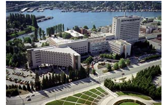
The University of Washington Medical Center

These centers provide a unique, balanced comprehensive and high-quality educational experience and expose all residents to the entire depth and breadth of orthopaedic surgery and medicine.