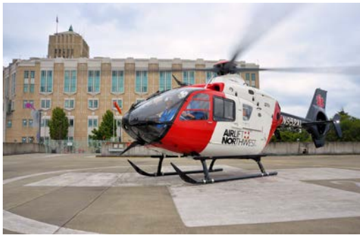
Airlift Northwest bringing a patient from WWAMI region to Harborview Medical Center