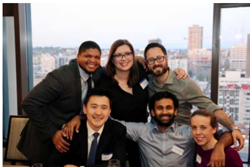
Current PGY-3's at the annual LeCocq Dinner