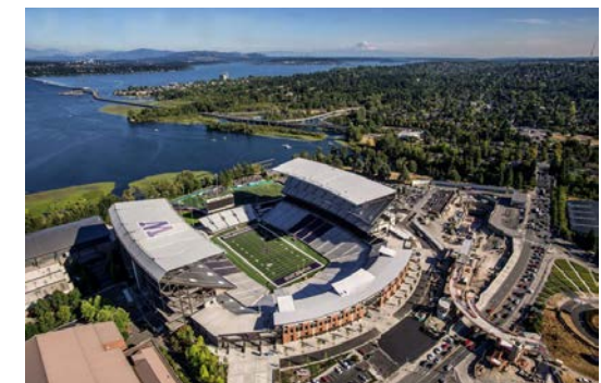
Sports Medicine Center is located below Husky Stadium

Our residency program is consistently ranked in the top ten in the nation.